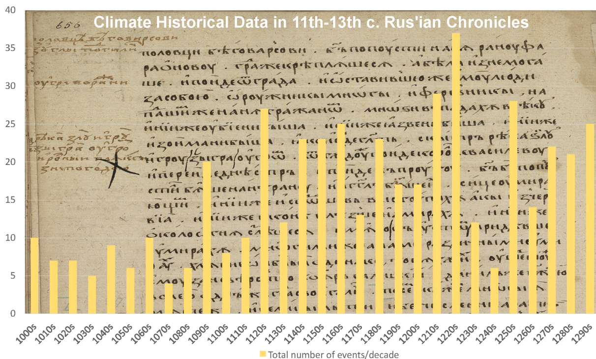
Figure 1: Number of meteorological extreme events, famines, epizootics, and epidemics mentioned in Rus'ian narrative sources between 1000 and 1300 CE in decadal values, according to Borisenkov and Paseckij (1983, pp. 79, 82, 86).

sources. In the first decades of the 19th century, Russian researchers were preparing statistical summaries about Russian climate from 147 temperature measurement sites throughout Russia. Konstantin Veselovskij collected this data and compared it with historical information extracted from different types of sources, going back as far as the era of Herodotus up to his contemporary age (1857; Zhogova 2013). Mikhail Bogolepov continued this pioneer work in climate history around the turn of the 12th century by collecting and analyzing information from published Cyrillic and Latin sources dating from the 10th century onwards (Bogolepov 1907; 1908). This body of Russian scholarship on climate history includes studies about anomalous weather (e.g. Borisenkov and Paseckij 1983; Borisenkov 1988); reconstructions showing fluctuations in Russian climate (e.g. Liakhov 1984; Borisenkov 1988; Klimanov et al. 1995; Klimenko et al. 2001; Slepcev and Klimenko 2005; Klimenko and Solomina 2010); fluctuations in river levels (Oppokov 1933); and famine years in Russia (Bozherianov 1907). The available information dates as far back as the early 11th century (see Fig. 1), though there is a significant drop in documentation in the 1230s and 1240s, likely due to the Mongol invasion of Rus' principalities in 1237.